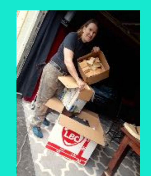
preparing LBC boxes for the Philippines