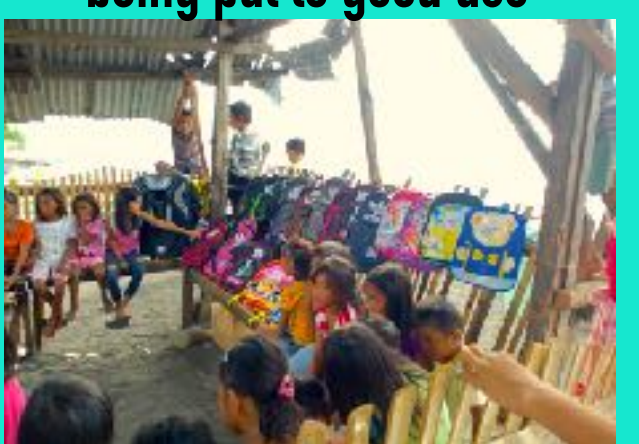
Students enjoying the distribution of backpacks celebration in our village