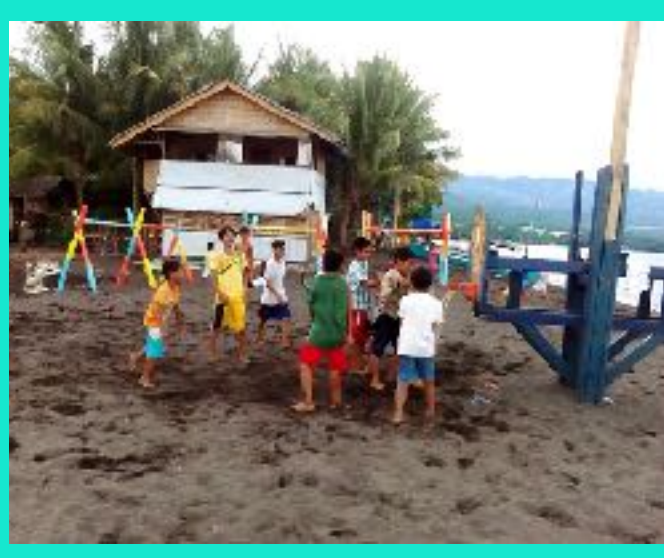
Kids playing on Subangan courts and equipment