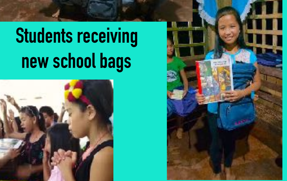
Kids reading the translated Action Bible that has been distributed