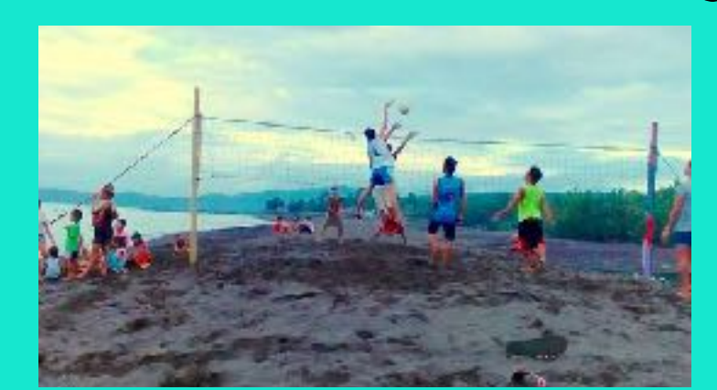
Kids playing volleyball at Subangan