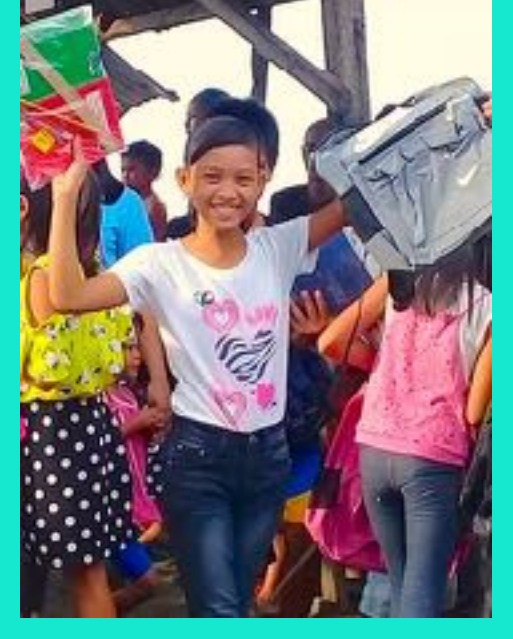
Students excited about school supplies for new school year